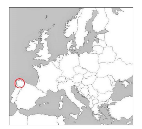
Figure 1. Situation of Gailica (Red). Own elaboration.

According to Spanish statistics, the autonomous community of Galicia (Figure 1) has shown the highest rate of fires in Spain for the last decades [30].