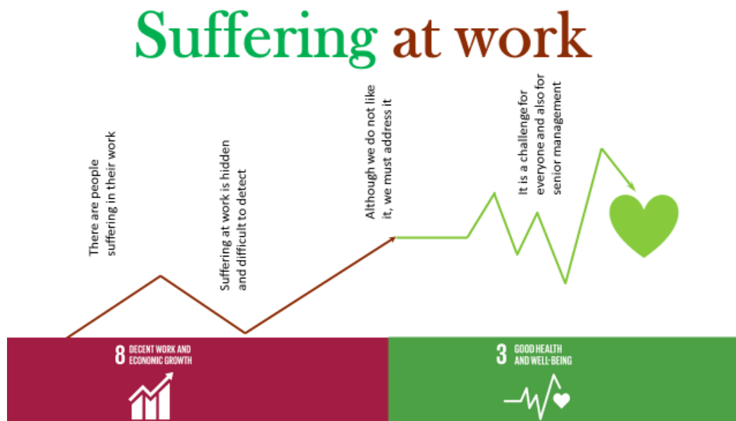
Figure 1. Sustainable development goals that must be achieved.

To achieve sustainable economic development, societies must create the necessary conditions so that people have access to quality jobs, stimulating the economy without harming the environment. There should also be job opportunities for the entire working age population, with decent working conditions (sustainable development goal (SDG) 8), without the employees becoming ill or suffering.