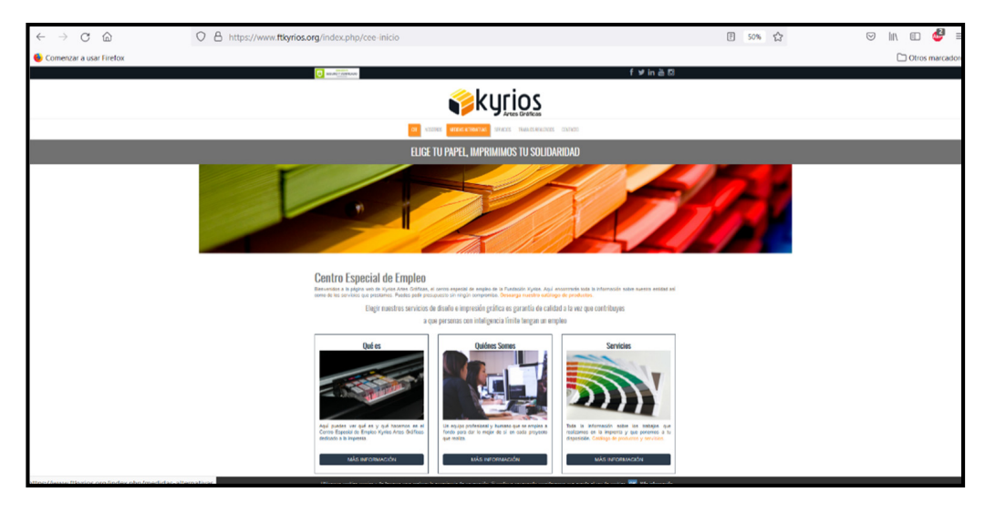
Figure 3. Kyrios website.

The project developed by the students of the ICA School consisted of improving and developing the website of the printing company Kyrios Artes Gráficas (https://www.ftkyrios.org/index.php/cee-inicio, accessed on 25 November 2021) see Figure 3. As a special employment center, it carries out a productive activity of design and graphic printing, competitive and of quality, giving a job opportunity to people with disabilities, offering them the necessary labor and social support to develop their work and motivate them towards the ordinary market. There are currently five people with intellectual disabilities on the staff who actively participate in all the work of the print shop, supervised by professionals from the Kyrios Foundation who support them in their day-to-day work.