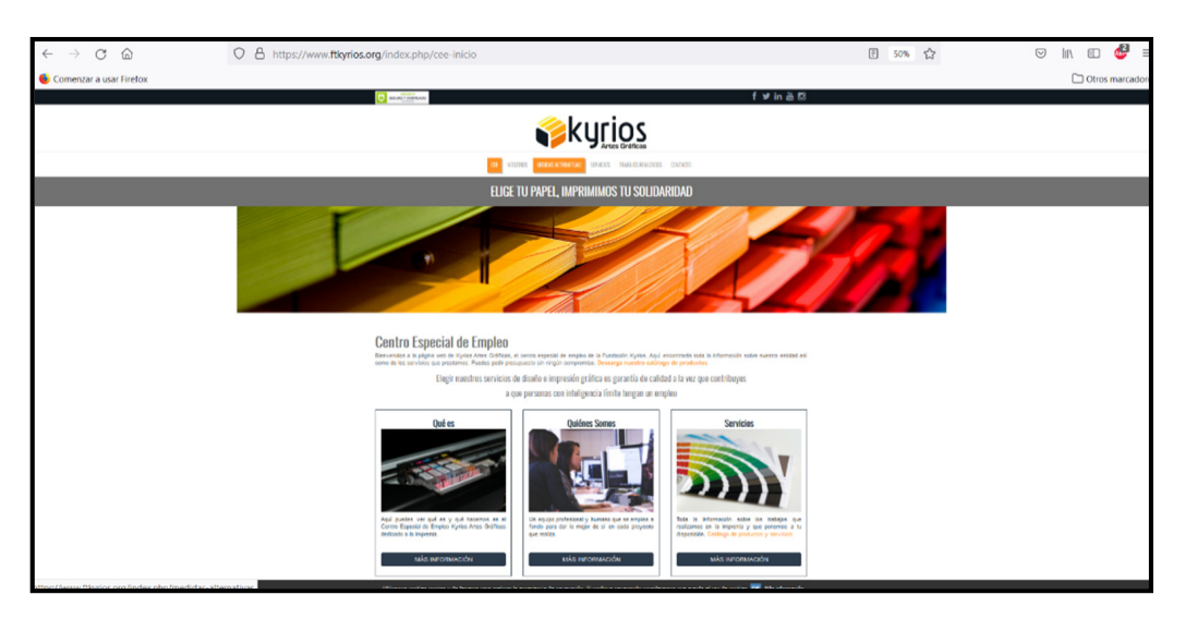
Figure 3. Kyrios website.

The project developed by the students of the ICA School consisted of improving and developing the website of the printing company Kyrios Artes Gráficas (https://www.ftkyrios.org/index.php/cee-inicio, accessed on 25 November 2021) see Figure 3. As a special employment center, it carries out a productive activity of design and graphic printing, competitive and of quality, giving a job opportunity to people with disabilities, offering them the necessary labor and social support to develop their work and motivate them towards the ordinary market. There are currently five people with intellectual disabilities on the staff who actively participate in all the work of the print shop, supervised by professionals from the Kyrios Foundation who support them in their day-to-day work.