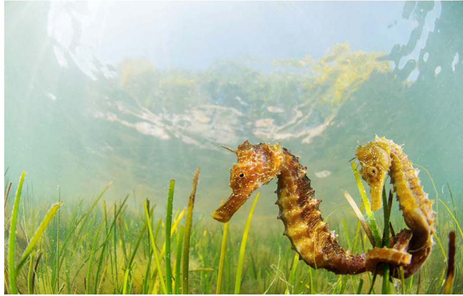
Seahorses ( Hippocampus Guttulatus), almost extinct in Mar Menor

To this day, there has been no agreement between landowners, authorities and experts. However, a popular legislative initiative (promoted by civil society) that aimed to give legal personality to the lagoon passed the first legislative steps and is about