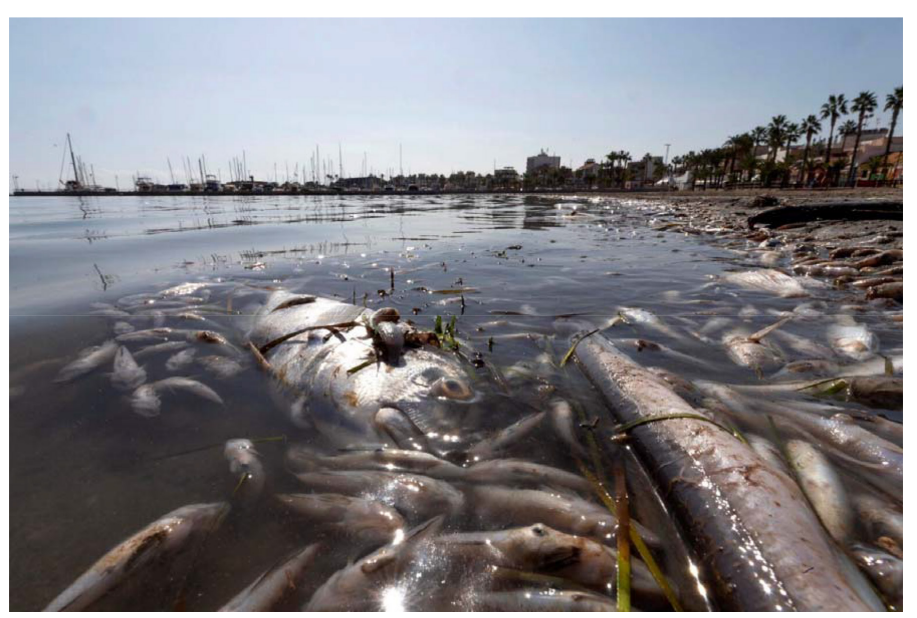
Dead fish in Mar Menor after a eutrophication episode.

rains occur, known as 'cold drops' in the Spanish Mediterranean, the nutrients rapidly run off into the lagoon causing extreme episodes of eutrophication, known as 'green soup' due to the green colour the lagoon adopts, such as that in September 2019 (see Figure 2). To sum up, studies vary, but recent estimates stand at approximately 300,000 tons of nitrates currently accumulated in the Quaternary aquifer, and a discharge of 530–4,800 kg of nitrates a day into the Mar Menor lagoon (MITECO, 2019).