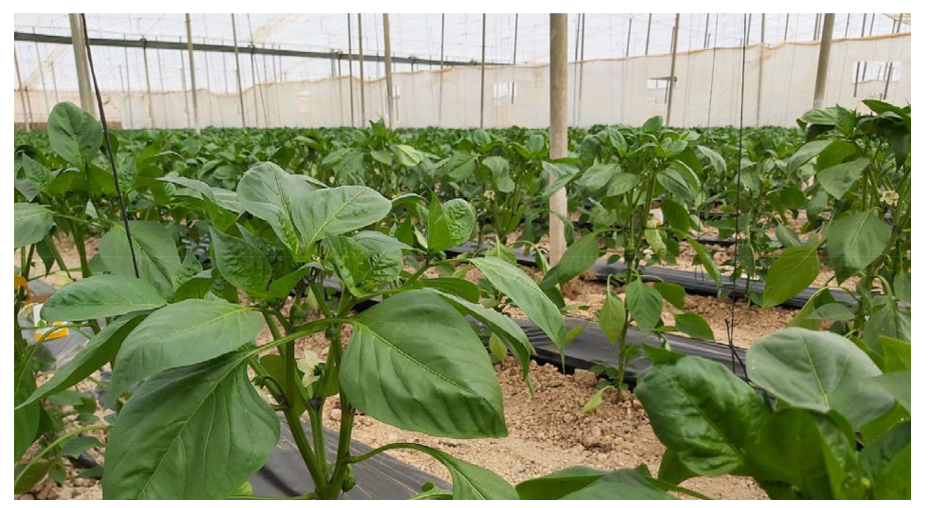
Greenhouse production in Campo de Cartagena

However, these agribusiness transformations could endanger the ecological balance in the region, as has occurred with the Mar Menor coastal lagoon. Various activities are indicated as having contributed towards ecological degradation in the Mar Menor area: agriculture, livestock farming, urbanism and tourism, waste disposal, and other activities carried out in the lagoon, such as