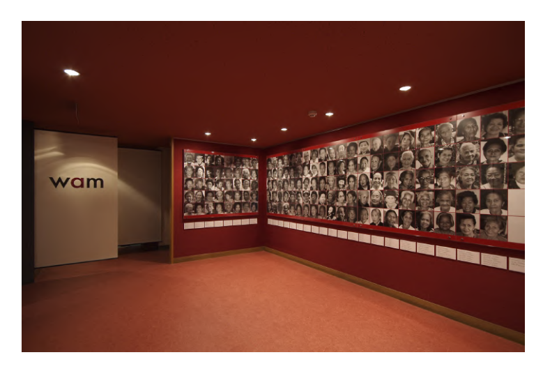
FIGURE 6. Exhibition in the Women's Active Museum on War and Peace (WAM, n.d.)

This museum is well known for their activism in favor of comfort women , and their dissemination of information about the issue in Japan. Since there is a general narrative of rejection and fatigue about comfort women , the role of the museum is very important to draw attention to the injustices that these women endured.