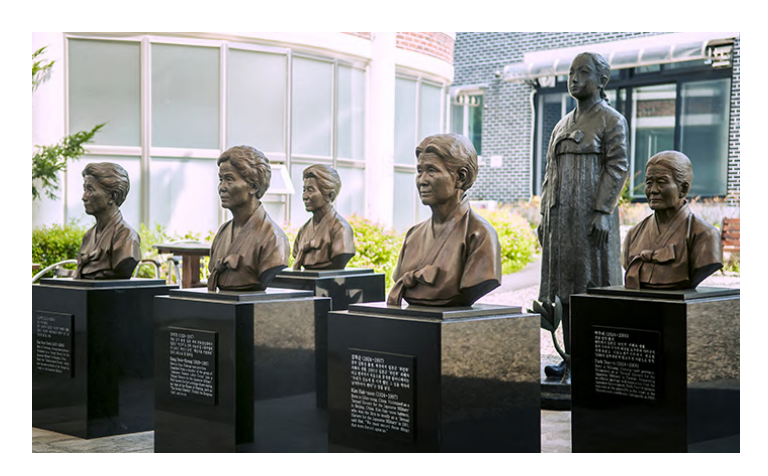
FIGURE 4. Exhibition in the House of Sharing (House of Sharing, n.d).

Although the whole colonial period has scarred South Korea, it is the systematic exploitation of comfort women and forced labor in the manufacturing industry that especially continues to evoke anger and demand justice. South Korea has consistently requested acknowledgment, apologies, and compensation from Japan due to these wartime atrocities, and despite the several attempts at reconciliation, South Korea is still today looking for an appropriate compensation for such a traumatic period of their history (BBC News, 2015).