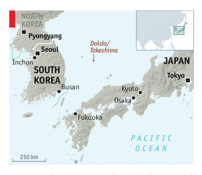
FIGURE 7. Map of South Korea and Japan (The Economist, 2018).

The islands of Dokdo/Takeshima are an archipelago located right between South Korea and Japan (see Figure 7). Dokdo is the name that Koreans have given the islands, while the Japanese call them Takeshima. They are two volcanic islands with very scarce vegetation and drinking water resources, which makes them quite difficult to inhabit (Genova, 2018). These small islands have been part of an ongoing conflict between South Korea and Japan for the