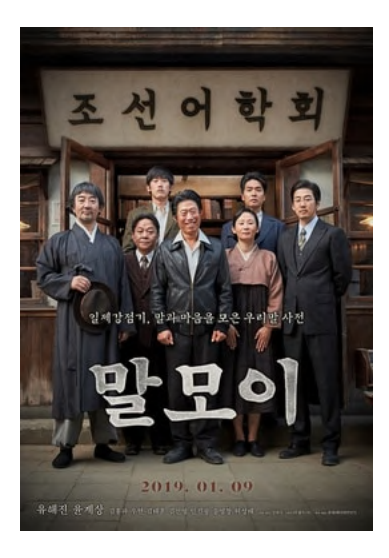
FIGURE 2. Movie posters for Parasite (left), Battleship Island (center) and Mal-Mo-E (right). (FilmAffinity, n.d.)

Movies such as 2017 The Battleship Island (元 京 in Korean) can be taken as an example of how Koreans remember the colonial era and critique Japan through TV productions. This movie, which tells the story of four hundred Koreans who try to escape from Hashima Island (Japan), where they had been forcefully taken to mine for coal, became a box office record in South Korea and is one of the most watched movies in the country (The Straits Times, 2017). According to the Korean newspaper The Korea Times (Shim, 2017), the Japanese media criticized the movie for containing distorted stories, while Koreans fans believed that the movie was too light and did not faithfully show the war crimes committed by the Japanese. This clearly shows how both countries have different narratives about the same issue. The Battleship Island tried to bring attention to the Korean forced workers in Japan during the Korean era, and while South Koreans thought it was not enough, the Japanese thought it was too much.