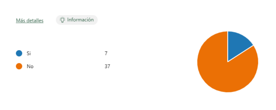
Do you know another provider that provides these types of solutions?

As a result, the insight reveals that 84% of the population is interested in taking a public speaking course, yet only 16% have already done so. This suggests that while there is considerable interest in the course among the populace, access to it appears limited.