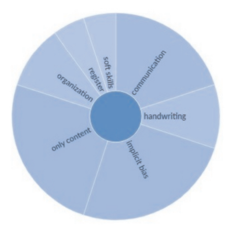
Figure 3. References to Language Assessment in Focus Groups 1 and 2.

I don't assess the English at all, let's say explicitly [...] And there are many times that implicitly you are assessing the English, because they are not expressing pretty well. So, whatever they are writing, it's pretty difficult to understand. (Participant 2, Focus group 2)