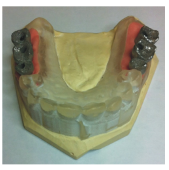
Fig 5. Master dental cast prototype with replica of the soft tissue and the steel structure of a partial prosthesis.