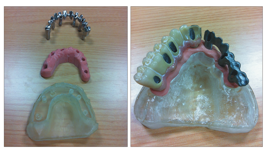
Fig 6. Master dental cast prototypes with replica of the soft tissue and the steel structure of a complete prosthesis.

Prosthetic structures built on a wrong model will not sit correctly on the implants, causing inadequate forces upon them; therefore, the use of appropriate materials significantly impacts the correct development of the model. In the tests, the prototyping materials of the model that