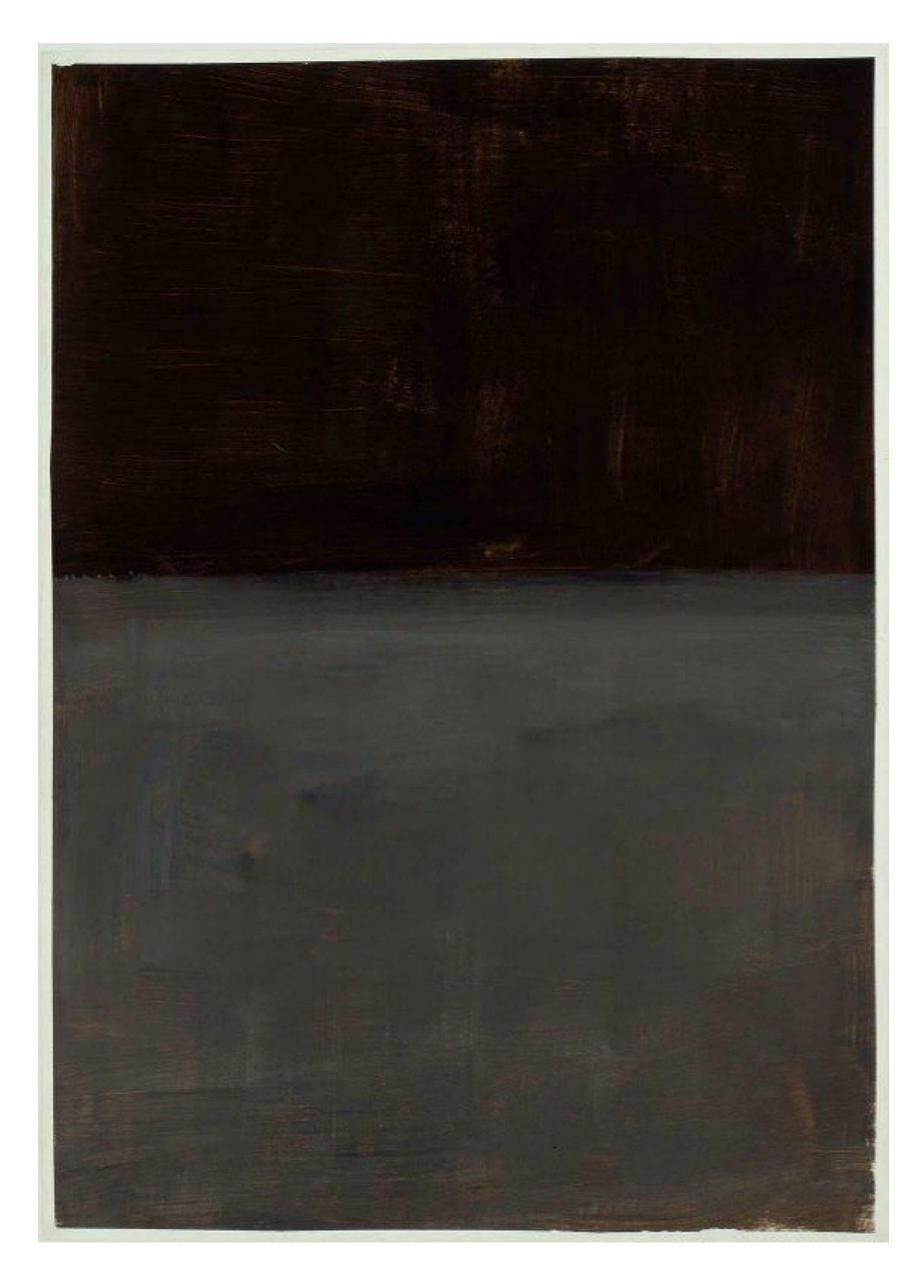
Mark Rothko, Untitled (Brown and Grey) , 1969. Acrylic on paper, 60\,3/8 x 47\,5/8 in. Metropolitan Museum of Art, New York, USA.