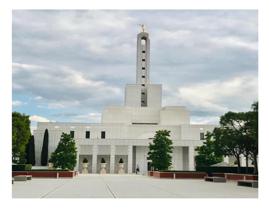
Image 1: Image of the Temple of The Church of Jesus Christ and the Latter-Day Saints in Madrid (Spain), taken by the author Sara Páez (May, 2019)

After comparing the number of members from its country of origin we can state that followers of the Latter-Day Saints Church in Spain represent a real minority within their society in the country, even if the number might be bigger than the one originally expected by those who are non-members of this church and its community.