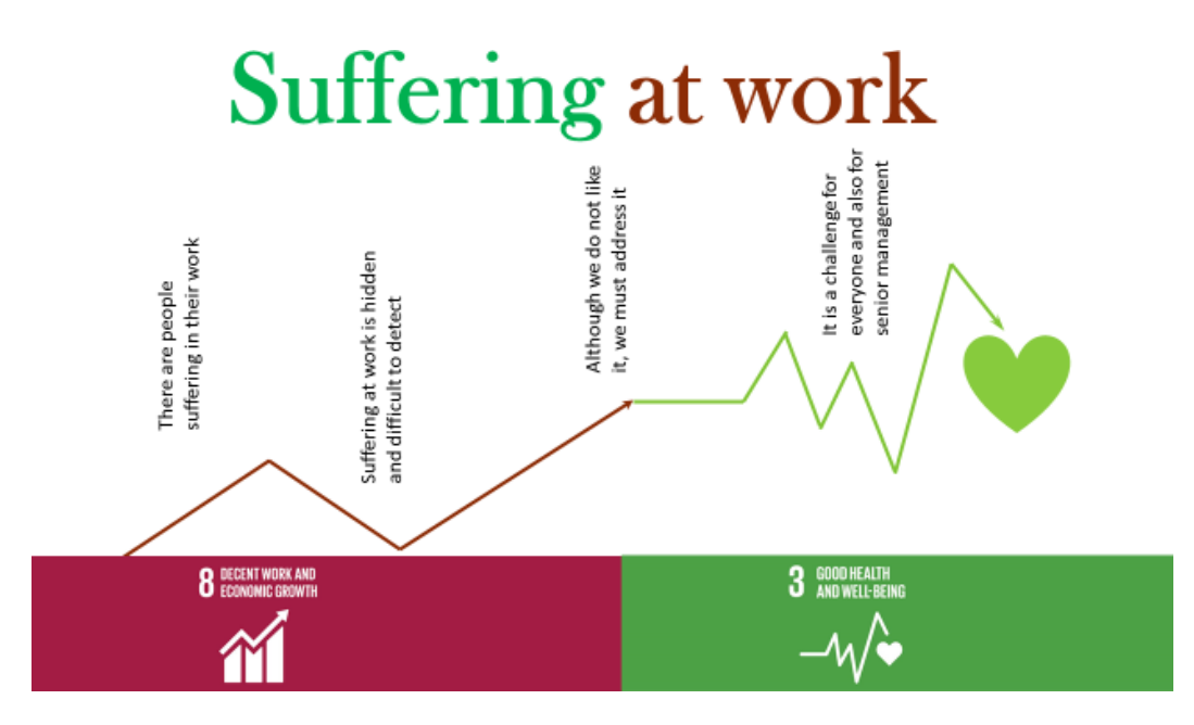
Figure 1. Sustainable development goals that must be achieved.

To achieve sustainable economic development, societies must create the necessary conditions so that people have access to quality jobs, stimulating the economy without harming the environment. There should also be job opportunities for the entire working age population, with decent working conditions (sustainable development goal (SDG) 8), without the employees becoming ill or suffering.