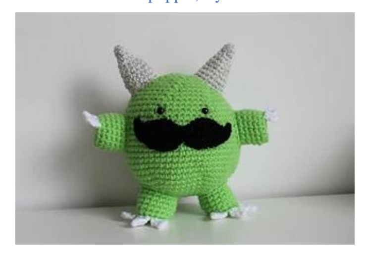
7.6 Annex 6. Class puppet, Ryan Reader