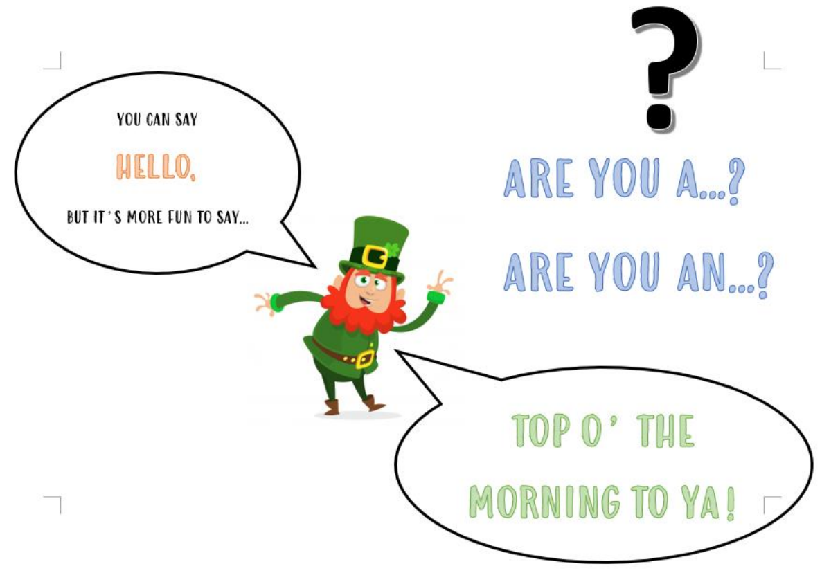
Image of the Leprechaun used was taken from: Freepik (https://www.freepik.es/vector-premium/ilustracion-divertida-duende-dibujos-animados_6962390.htm)