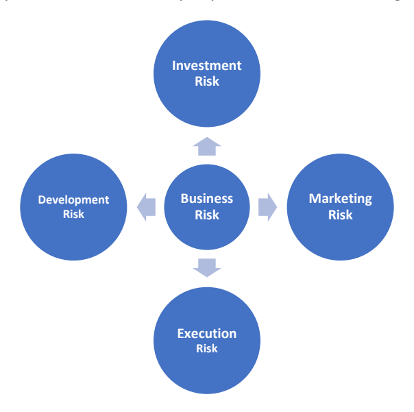
Figure 9.

This separation of competences can be easily explained in the following diagram: