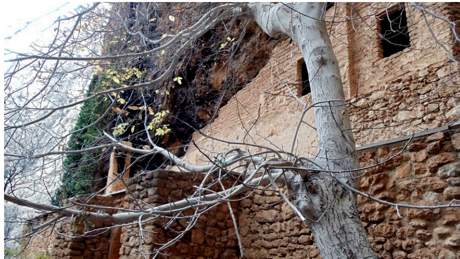
Figure 3. San Martín de la Val de Onsera (Saint Martin of the Bear Valley) is the only SNS named after an animal in the Aragonese Pre-Pyrenees.