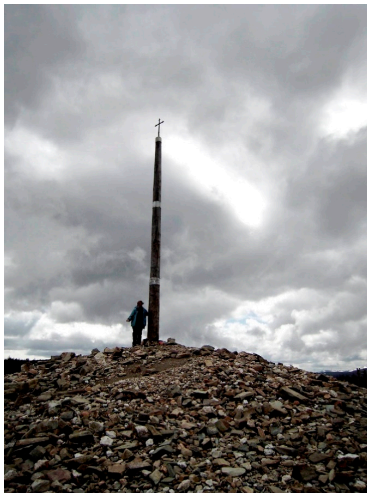
Figure 8. Over the years, pilgrims along the Camino de Santiago have left thousands of stones and pebbles forming large humilladeros , like the one sitting under La Cruz de Ferro.