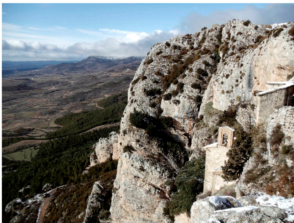
Figure 1. The 13th century Virgen de la Peña (Virgin of the Rock) chapel and hermitage in Aniés, Aragón.

Marianized (Curchin 2014). In the south and the Mediterranean coast, Roman cults were transformed into those of the Saints and the Virgin. All over the peninsula, the Roman Catholic Church raised churches, hermitages and sanctuaries at traditional cultic sites such as springs, rivers, caves, and cliffs where locals paid tribute to pagan gods. In the 13th century, probably influenced by the Cistercian reform, Marian shrines began to proliferate in Spain and overshadowed previous patron saints (Figure 1). Through a complex historical process, popular devotion first universalized the Marian cult—thus, simplifying the diversity of the cult to the saints—but soon after re-localized it again while generating hundreds of distinctive titles or “advocations” (from the Latin advocatio , pleading the cause of another). Many of these advocations, such as Rocío (Dew), Montserrat (Rugged Mountain), Espino (Common hawthorn), Roser (Rose), Peña (Rock), Fuensanta (Holy Well), and Covadonga (or Cova-donga , Cave of the Lady), are nature related.