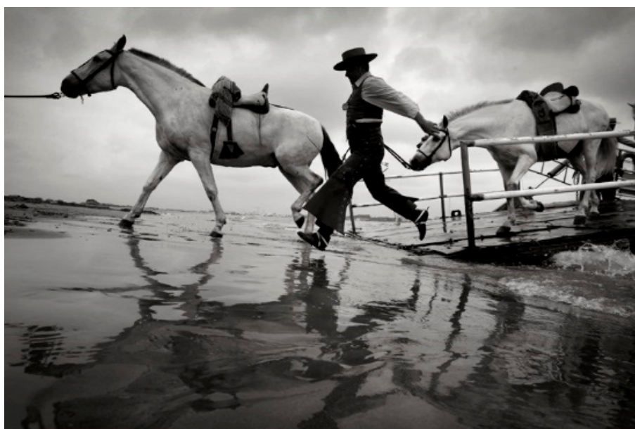
Figure 10. Pilgrims on their way to El Rocío.

In the baroque mentality, holy water from heaven was a divine remedy for drought. This is the reason why, in a plenary agreement of the town of Almonte held in 1726, the city hall decided to ask its Patroness to bring the “ Santo Rocío de sus aguas ” ( The Holy Dew of its waters ). Nowadays, even though modern irrigation systems pump underground water during dry years, devotion to the Madre de las Marismas has not declined. On the contrary, it has increased substantially over the last decades, attracting ever larger numbers of pilgrims, since, as Antonio Ariño wrote three decades ago, “old rituals with a clear agrarian functionality (a plea for rain) are taken up again in a different socioeconomic context and are transformed into symbols of a real or longed-for identity” (Ariño 1989, p. 483).