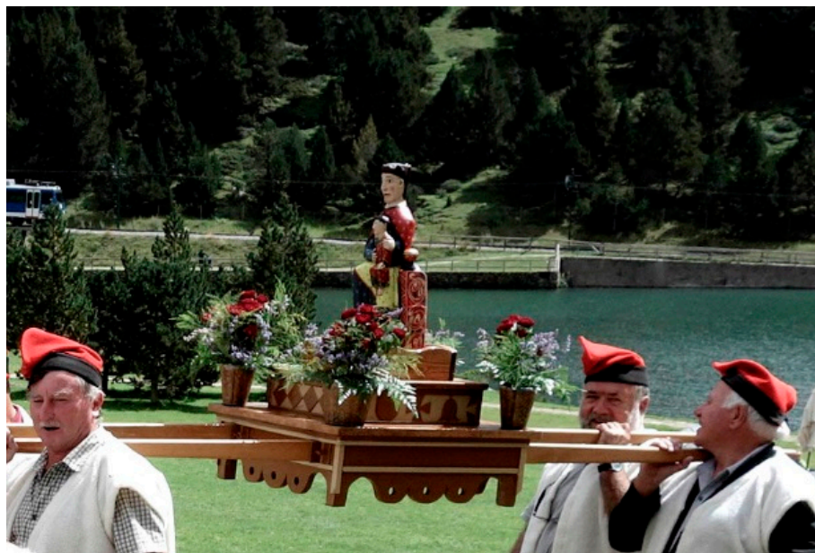
Figure 4. The patroness of the Pyrenees, la Mare de Déu de Núria, is carried to her sanctuary on 1 September 2016, the feast of St. Giles, patron saint of shepherds.

In Christian theology, Mary is not a person of the Holy Trinity, yet intense popular devotion and veneration gave rise to her cult and fostered an impressive iconographic development of her image. In most processions, her images are surrounded by flowers and often the final stretch of the route is carpeted with branches, leaves, and petals (Figure 4).