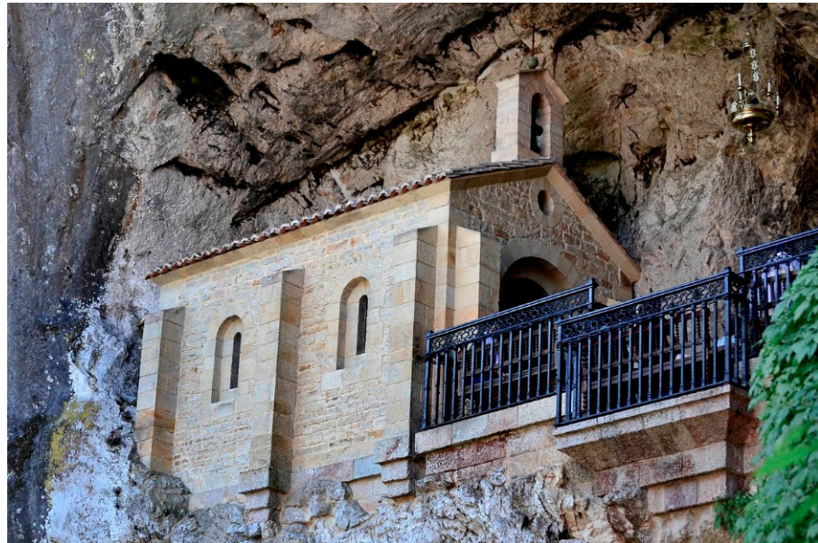
Figure 6. The chapel of Covadonga.

the custodians at the Santuario de Covadonga affirmed, “the hierophanic elements of the mountain, the cave, and the water play an important role in the (local) religiosity. The image of the Virgin of Covadonga is venerated inside the cave”. Likewise, at the Virgen de la Cueva Santa (Virgin of the Holy Cave) sanctuary in Altura (Castellón), the local priest underlined the importance of Cueva (cave) as an advocacy or Marian title and brought to the fore the fact that she was the Patroness of Speleologists.