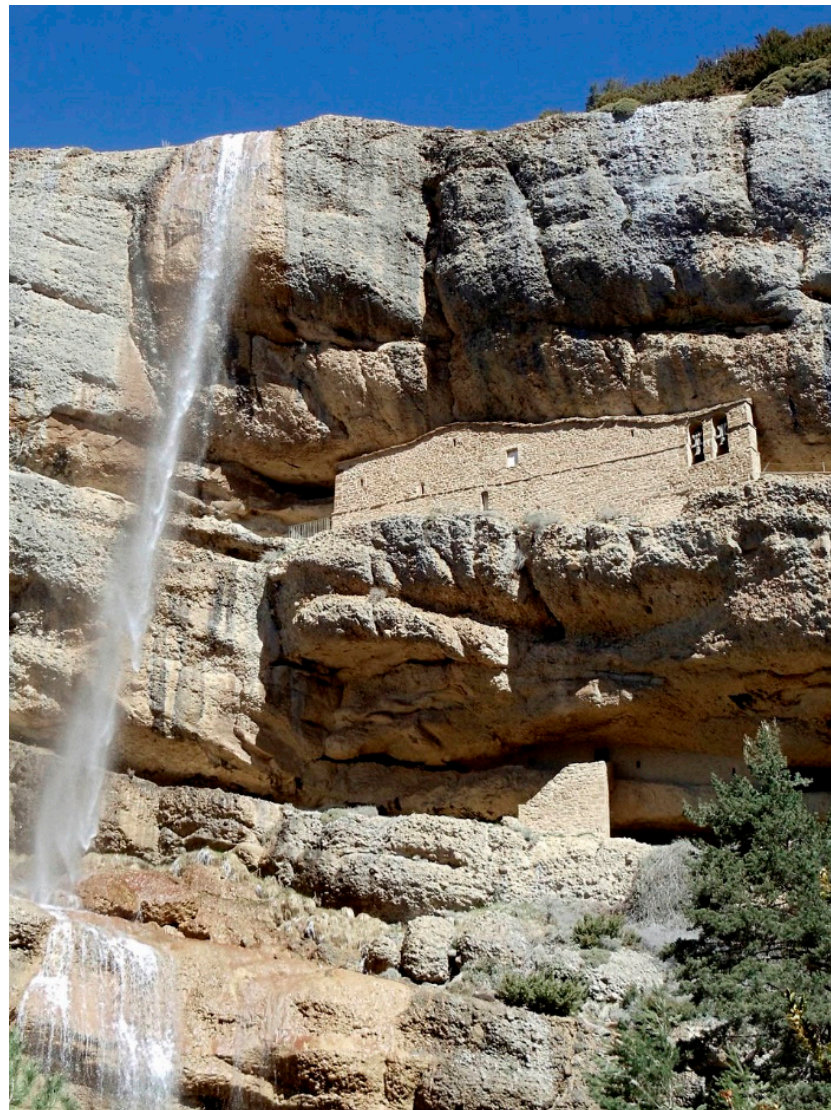
Figure 2. The Yebra de Basa Hermitic complex near Santa Orosia , Aragón.

In sum, just as the tree (thorny bush)— rock (cave)— water (fountain) are some of the key natural elements that articulate the sacredness of a SNS (Figure 2), the sanctuary—image—miracle also configure a complex unity mediated by distinctive, local narratives, devotions, and rituals. According to José María Fuiench, “Water, tree, and rock are elements that have always formed a universal cosmos, wherever a hermit dwells. A trilogy of life where the water symbolized purification; the tree, regeneration; and the rock, immortality” (2007, p. 17).