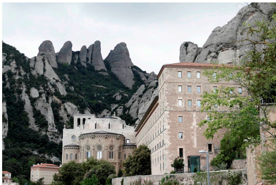
Figure 5. The impressive monastic complex of Montserrat is surrounded by mountains and forests.

the procession that leads the devotees to the sanctuary (Figure 5). Additionally, of course, bouquets of flowers are usually offered as a sign of gratitude and left at the altar or around the image presiding the sacred site.