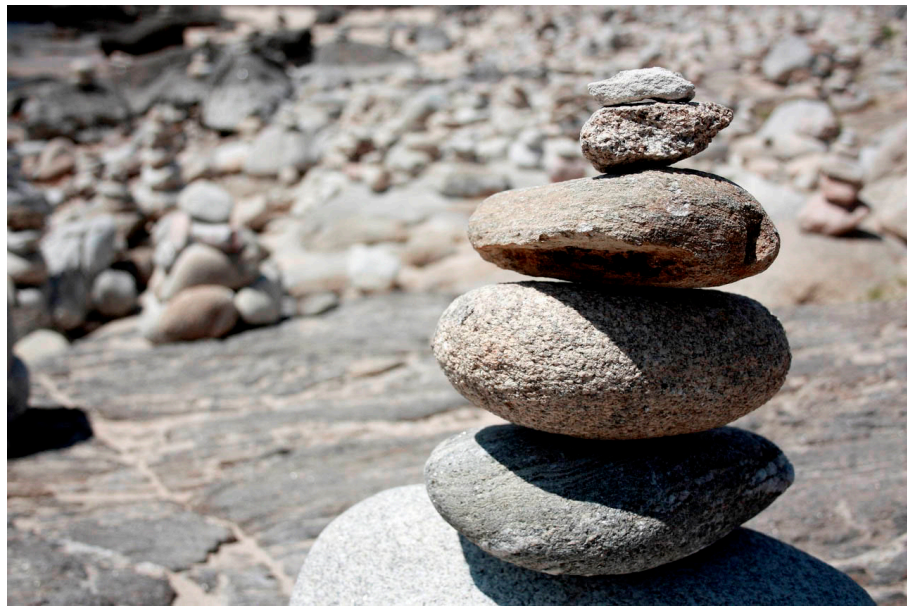
Figure 7. Stone heaps along the Camino de Santiago.