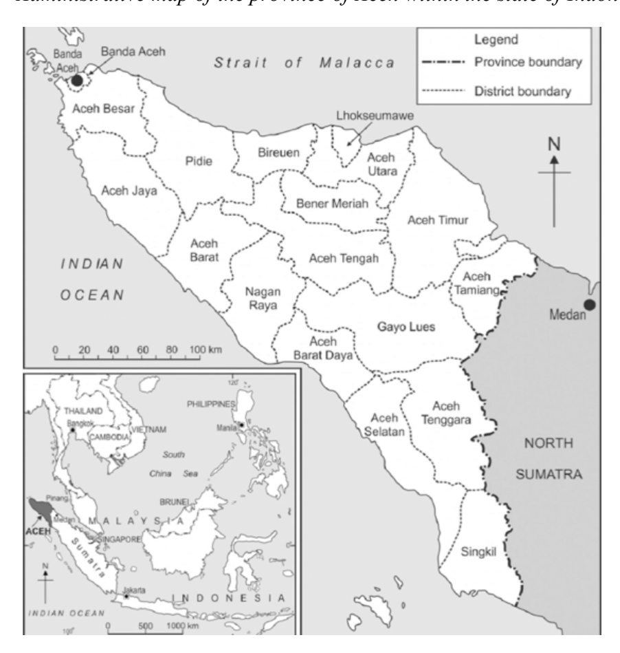
Figure 3 Administrative map of the province of Aceh within the state of Indonesia