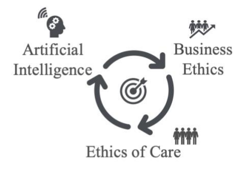
Figure 1. Dissertation intersection

The reader should be aware that similar explanations are found between the chapters (of AI, the ethics of care, the categories, and other relevant concepts and definitions). Also, references are listed in each chapter following the guidelines of the publication where they pertain. Figure 1 is an illustration of the intersection of disciplines where this dissertation contributes. Also, figure 2 is an illustration of the dissertation structure, the chapters, and the concepts presented in those.