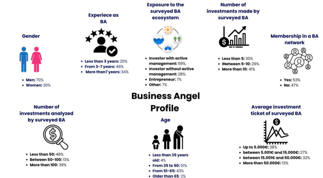
Fig. 3. Survey business angel profile.

played by BAs in the venture financing process remains scarce because of the challenges associated with data accessibility (Vega-Pascual et al., 2024).