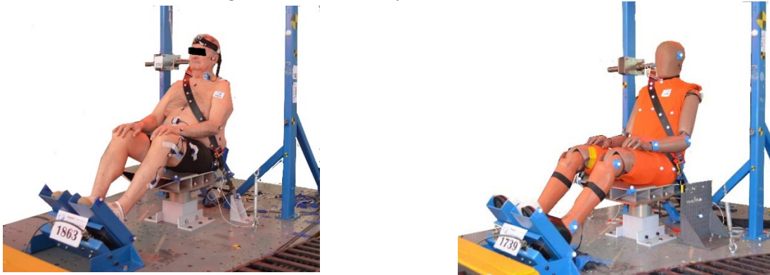
Fig. 1. Initial position of test surrogates in the sled.

The test fixture used in the study approximated the seating position of a car occupant (passenger configuration) in a simplified manner that allowed the use of motion capture to quantify the occupant's kinematics. The fixture consisted of a rigid foot-restraint, a rigid non-flat seat, and a metal-wire flexible seat-back [4]. A three-point seat belt (non-force-limited, non-pretensioned) was used to arrest the forward motion of the test subjects (Fig. 1). All these parameters were designed within the SENIORS project. The sled deceleration pulse was chosen to ensure a safe environment for the volunteers [5]. It consisted of a trapezoidal pulse with a plateau around 3.5 g over approximately 60 ms and a total duration of 120 ms, resulting in a nominal delta-v of 8.8 km/h. The interaction between the occupant and the fixture was recorded using load cells under the seat pan and the footrest and three gauges measured the tension at three different locations on the seat belt. Volunteers were fitted with a head strap incorporating three linear accelerometers and three angular rate sensors. Approximately 40 data channels were recorded in the THOR-50M dummy. All data were acquired at 10,000 Hz and processed and filtered following SAE J-211 defined procedures.