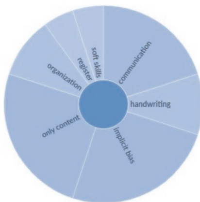
Figure 3. References to Language Assessment in Focus Groups 1 and 2.

I don't assess the English at all, let's say explicitly [...] And there are many times that implicitly you are assessing the English, because they are not expressing pretty well. So, whatever they are writing, it's pretty difficult to understand. (Participant 2, Focus group 2)